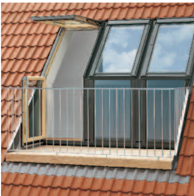
Roof terrace system.

GEL can be opened by means of a handle at the bottom sash. The window opens up to 45°.